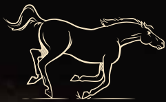
Stumbling or tripping