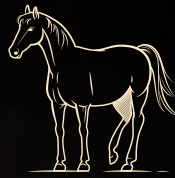
Lameness or gait abnormality