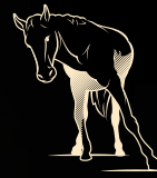
Leaning against walls

If you see these signs, it could be EPM.